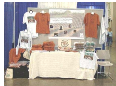
Below: Our booth at the 2005 Tri-Society/AWSS Meetings.